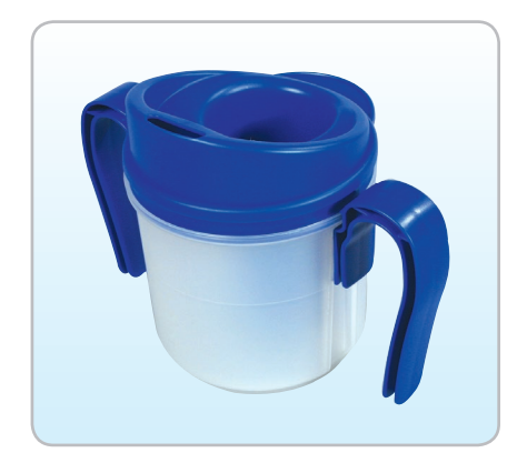
#82322 PROVALE™ Cup

More Oral Management Products online at AliMed.com