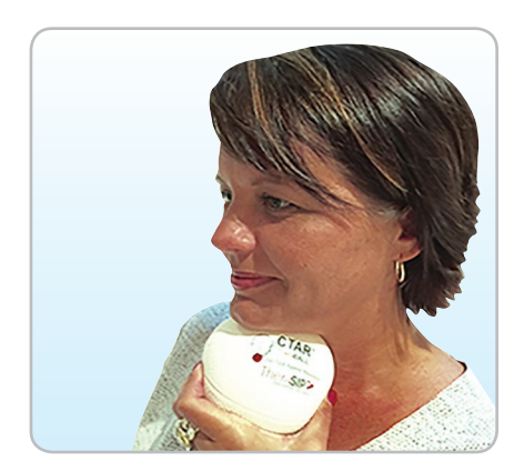
#83345 CTAR Ball