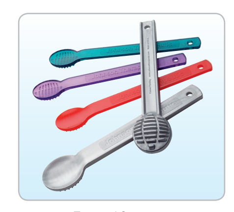
#82266 Textured Spoons