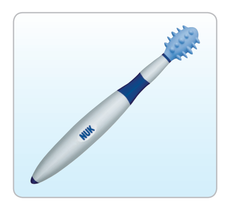
#83090 NUK® Massagers