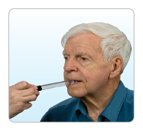
#81868 Ice Finger