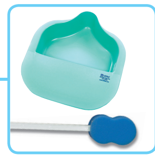
Bathing and Toileting

*Any order placed before 3 p.m. EST, if in stock, ships the same day!