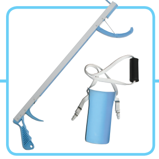
Aids to Daily Living (ADLs)