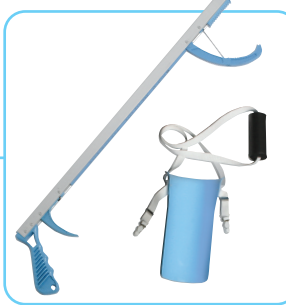
Aids to Daily Living (ADLs)