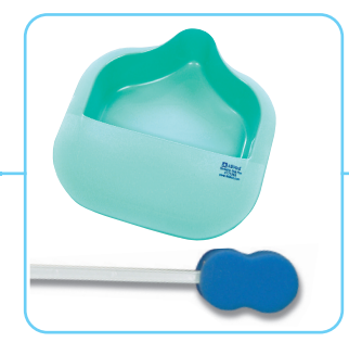
Bathing and Toileting