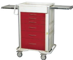
Select 30% lighter—loaded with features