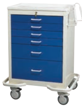
Standard Durable and affordable