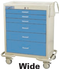
Wide Over 40"W for maximum storage