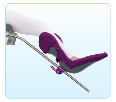
Well Leg Holders