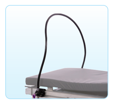
Flexible Anesthesia Screens