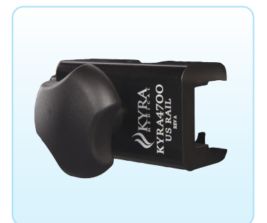
Simple Blade Clamps