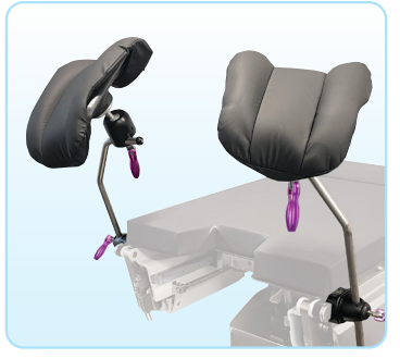
Goepel Knee Crutches