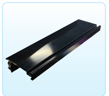
Table Width Extenders