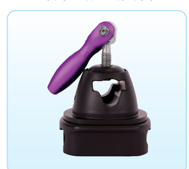
Round Post Clamps