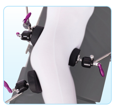
Lateral Positioning Sets