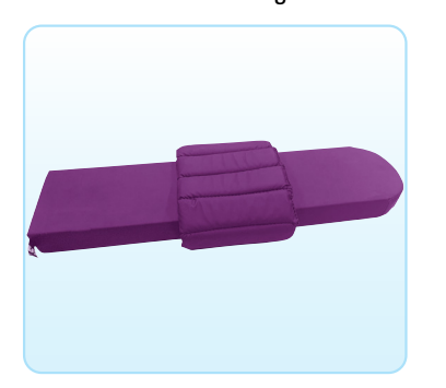
Clamshell Armboard Pads