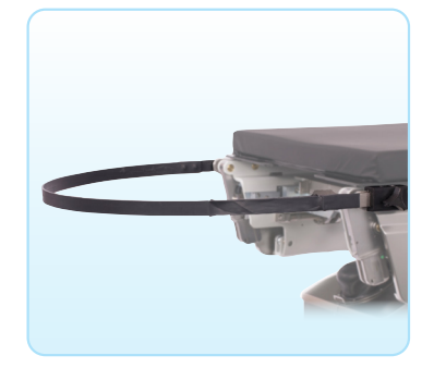
Urology Attachment Bands and Drainage Bags