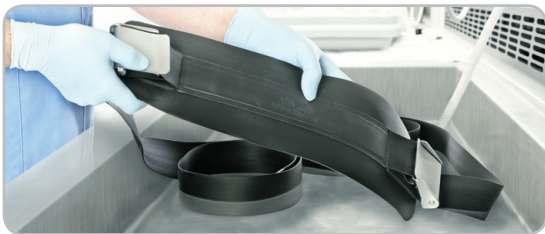
Withstands high-level disinfection