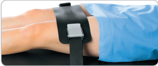
Reduces the risk of cross-contamination