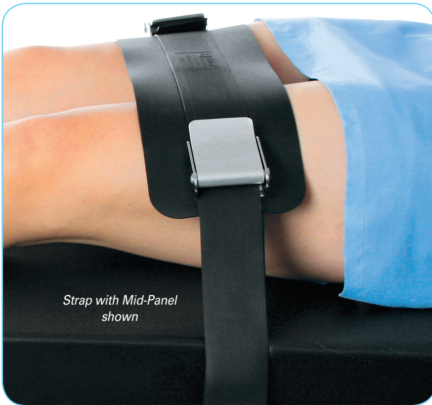
Strap with Mid-Panel shown