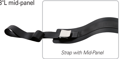
Strap with Mid-Panel