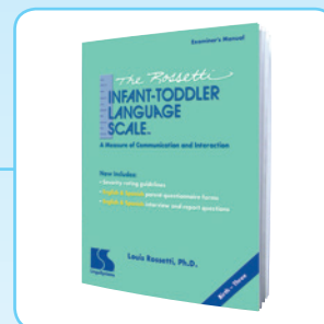
Pediatric Speech and Language

Any order placed before 3 p.m. EST, if in stock, ships the same day! Prices, product availability, and specs are subject to change.