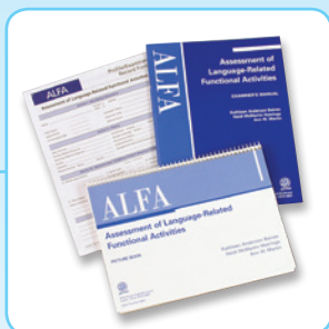
Adult Speech and Language