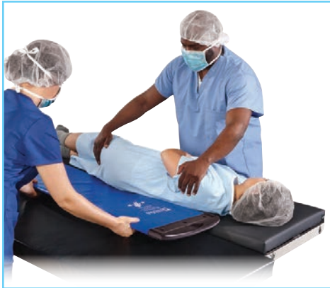
Safe Patient Handling