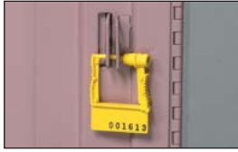
Breakaway Locks Low security, best for quick access

Five locking options offer the security level that's right for your department. All carts (except Emergency models) ship with key override option unless otherwise specified.