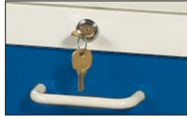
Key Locks Low security, best for quick access