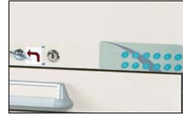
Electronic Locks Medium to high security, best for monitored access