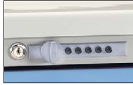
Push-Button Locks Medium security, best for multi-person use