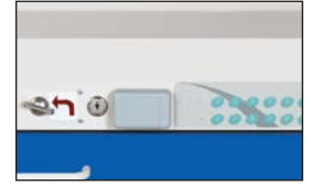
Proximity Locks High security, best for monitored access