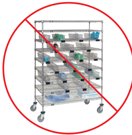
Uncovered carts can leave linens—and patients—exposed to contaminants