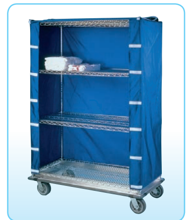
Cart covers provide infection control and help you avoid citations