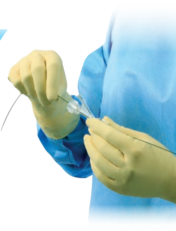
Economical Original for the cost-conscious customer