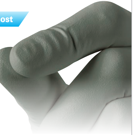
AliGuard's finely textured fingers and palm offer advanced tactile sensitivity and dexterity