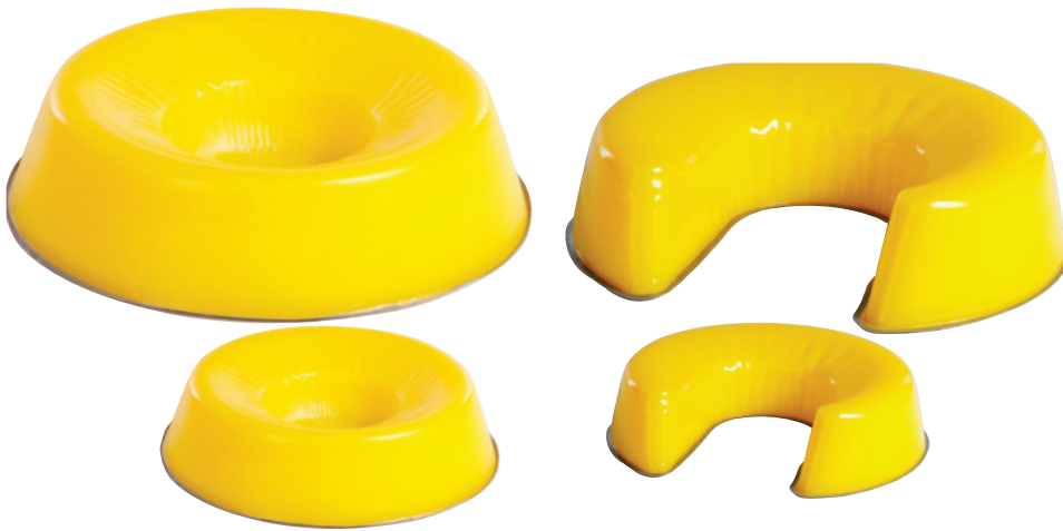
Head Donuts and Horseshoes Available in Adult and Pediatric