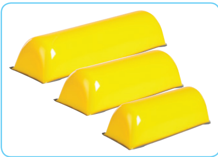
Body Positioners Chest Rolls shown