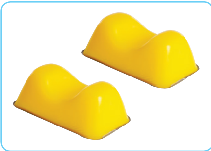
Lower Extremities Heel Pads shown