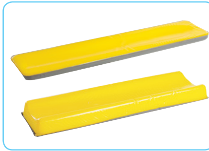
Upper Extremities Standard and Contoured Armboards shown