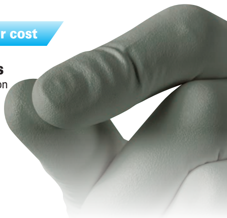
AliGuard's finely textured fingers and palm offer advanced tactile sensitivity and dexterity