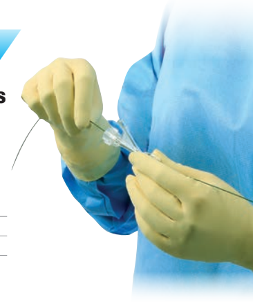
Economical Original for the cost-conscious customer