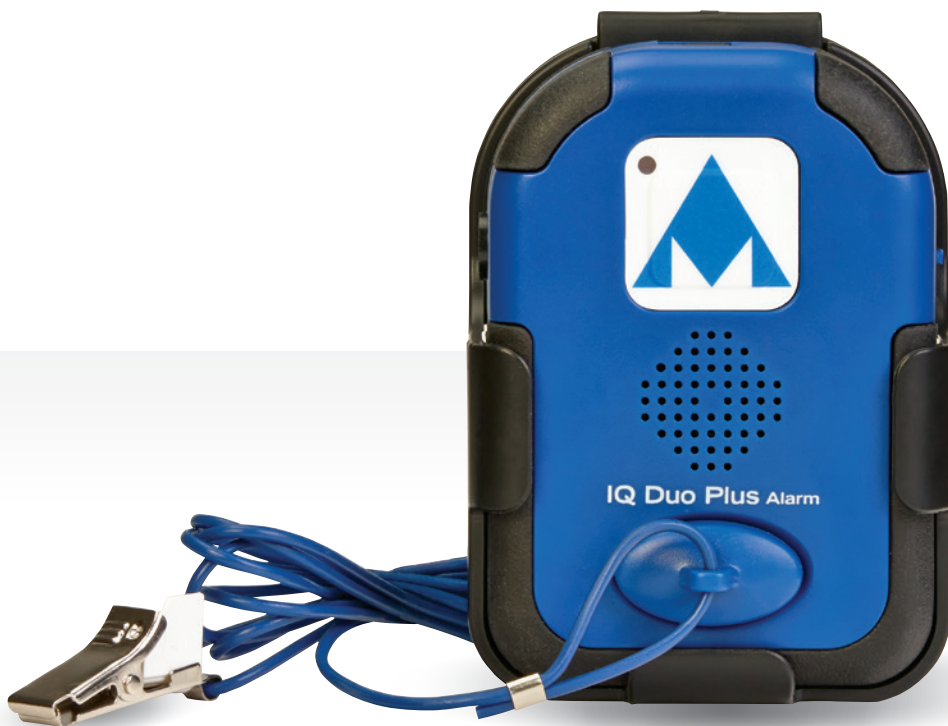
Pull-Cord or Sensor option