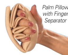
Palm Pillow with Finger Separator

Palm Pillows keep nails from digging into palms. Finger Separators have four soft layers of MicroSpring Textile™ between each finger.