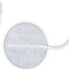
#TY31703 2" Round