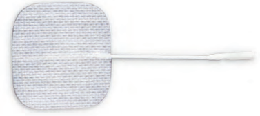
#TY31700 2" Square