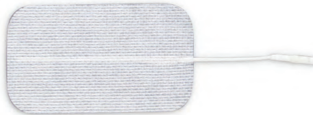
#TY31706 2" x 3½" Rectangle