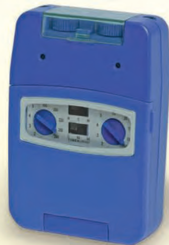
Analog TENS 2500 #TY32396