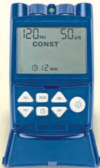
Digital TENS 3000 #TY32394