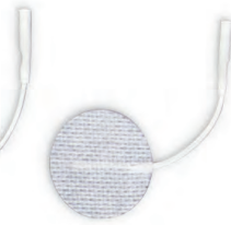
#TY31703 1¼" Round