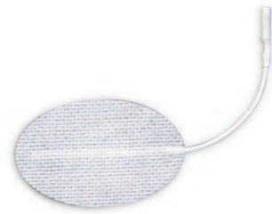
#TY31704 1½" x 2½" Oval