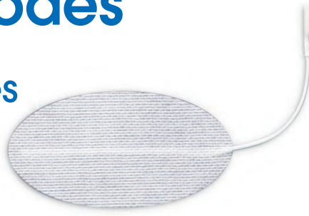
#TY31705 2" x 4" Oval