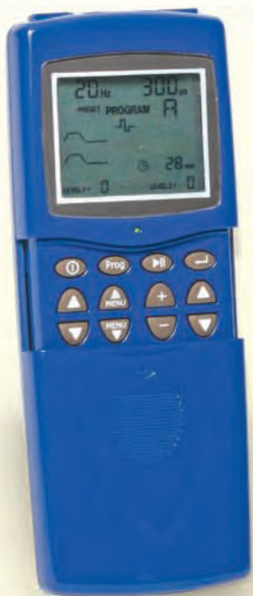
Digital EMS 3500 #TY32411