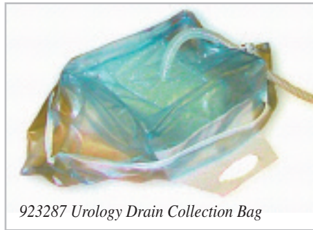
923287 Urology Drain Collection Bag