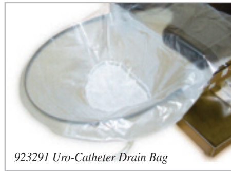
923291 Uro-Catheter Drain Bag