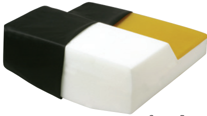
Convex Base — T-Gel™ version