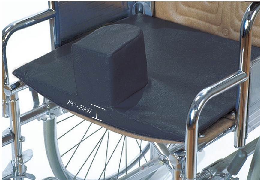
Solid Seat Insert™ with Pommel