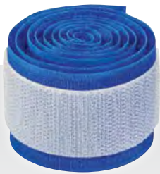
AliStrap® Precut Positioning Strap shown