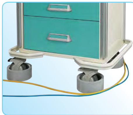
AliMed Caster Guards Keeps cords free from entanglement