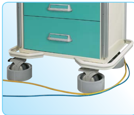
AliMed Caster Guards Keeps cords free from entanglement