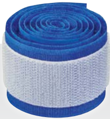
AliStrap® Precut Positioning Strap shown